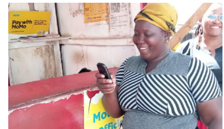
Mobile money client in Zambia, March 2022

Oikocredit is a social impact investor and worldwide cooperative with over four decades of experience in promoting sustainable development through investment in financial inclusion, agriculture and renewable energy. Oikocredit is guided by the principle of empowering low-income people to improve their livelihoods. MLF Zambia has secured a local currency loan equivalent to US$ 700,000 (spread across two disbursements) from Oikocredit. The loan period is for three years and will be used to expand the loan portfolio to reach more clients.